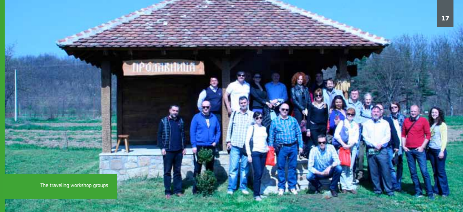
The traveling workshop groups