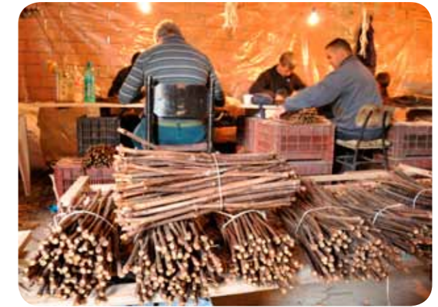
Skilled workers from Serbia producing vine grafts at company Agrokalem, Timjanik

is a widespread need among farmers to diversify their products, and where possible to add value to them in order to get a fair income and gain competitiveness through cooperation.