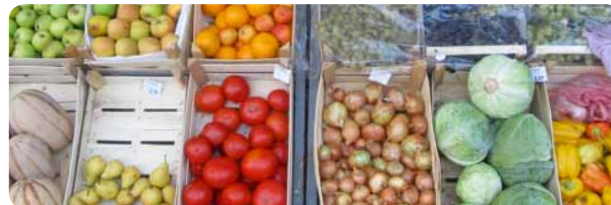
Local products on sale near Mostar, Bosnia and Herzegovina

"With €5 million worth of funding, the multiannual Rural Grant Scheme supports the development and modernisation of three agriculture sub-sectors – dairy, meat, and fruit and vegetable processing. In order to bring Kosovo's agricultural industry up to EU standards, the programme supports a variety of areas. These