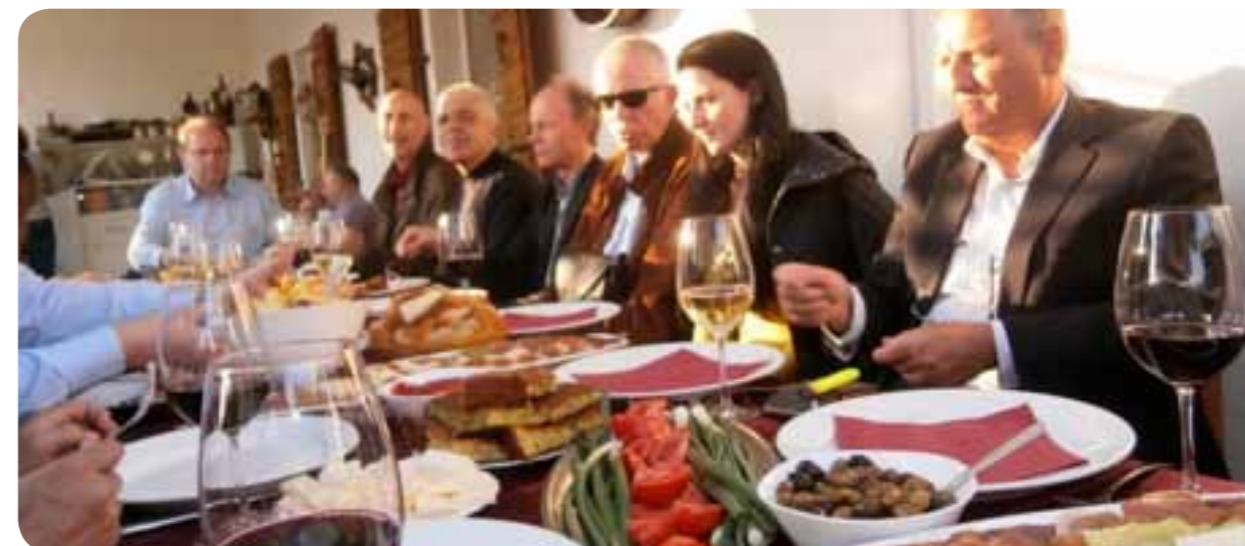
The group enjoys a wealth of local products