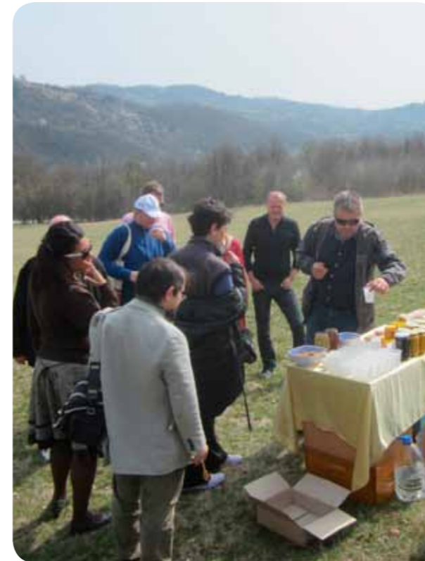
Meeting the President of the Kraljevo Beekeepers' Association