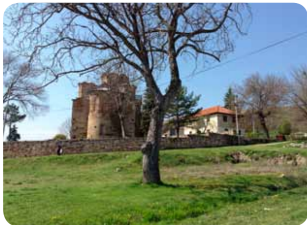
St George's Church, Staro Nagoricane – national heritage site

It comprises a 4-room guesthouse and back-packer accommodation, with home-grown, home-cooked, pick-your-own organic food and drink, and outdoor activities in the adjoining national park. Additional accommodation is sourced in the village when needed. The facilities are self-built, rustic and constantly being improved and extended. The owner seeks to 'think as the visitor does, welcome everyone with a smile and make things clear, simple and practical'. The system is based on no set prices, rules or timetables. He has not sought public subsidies or grants, and never will do so. He attracts visitors from all over the world. The guesthouse is a member of the Slow Food movement, which supports local producers and organics; and has worked with other local producers to sell good food to visitors.