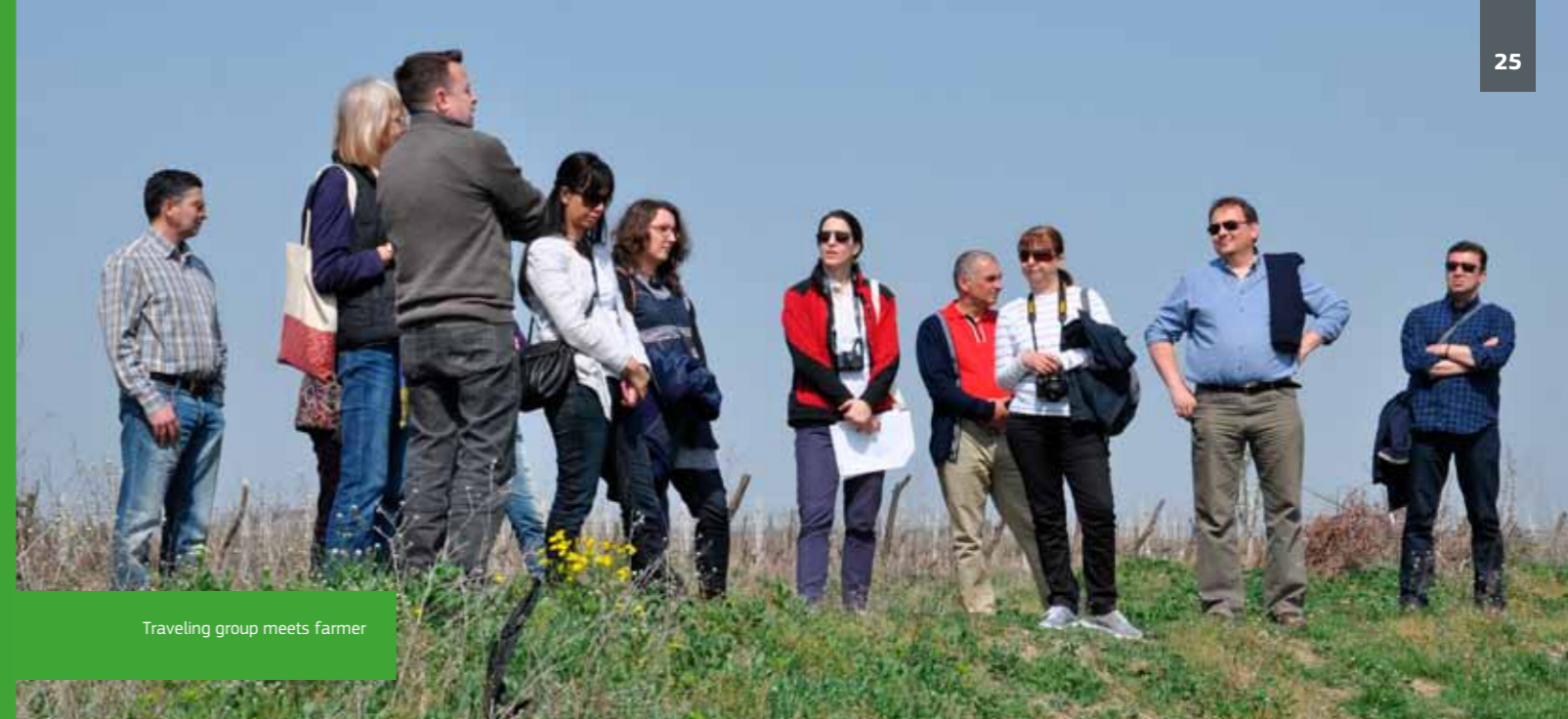
Traveling group meets farmer