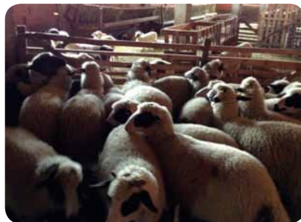
Sheep on an organic farm in Pehcevo municipality

The small family farms in the country face the same difficulties that small farms face in many parts of Europe – lack of land, lack of capital, weak bargaining position in the food chain, low incomes. Many of the smallest farms do not have registered status, and are therefore not eligible for some measures of support from national or EU funds. Many middle-sized, and even some larger, farms are constrained by inability to gain further land (partly because of uncertainty with the land registry), lack of capital, the cost of credit, poor infrastructure and other factors. Some are adversely affected by climate change, with increased temperature and reduced rainfall: this poses a challenge for irrigation and development of new cropping strategies. Some farmers are obliged to move away from tobacco monoculture. For these and other reasons, there