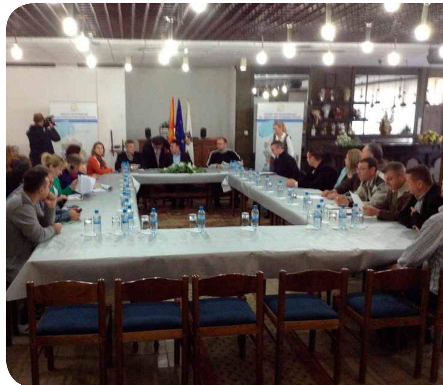
Meeting the Strumica Local Action Group in South-east Planning Region, the former Yugoslav Republic of Macedonia

Moreover, these Rural Development Networks are federated within the Balkan Rural Development Network. They work closely with the Standing Working Group, and thus provide a crucial connection between civil society and governments. They have strong links to the PREPARE Partnership for Rural Europe.