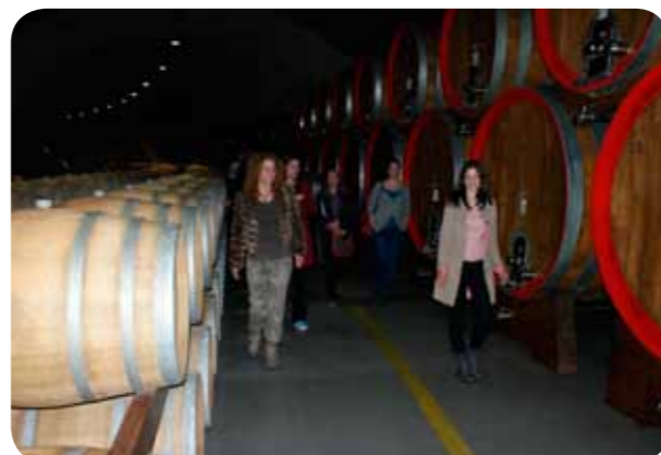
The cellar of wine company ‘JSC Plantaze’, which exports wine to 40 countries

JSC Plantaze. On a very different scale is the wine company ‘JSC Plantaze’, which produces 17 million bottles of wine each year and exports wine to 40 countries. It is the biggest export company in Montenegro, and has won 800 awards at international fairs. It has 700 employees, plus 2000 migrant seasonal workers who harvest grapes from its 2314 ha of vineyard; it also buys grapes from small producers in the region.