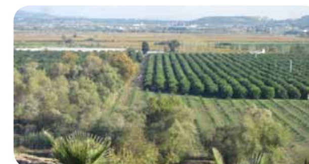
Orchards near Konya, Central Anatolia, Turkey

The experience showed me that a successful and sustainable rural development can be realised through strong dialogue, cooperation and networking between local stakeholders, including public and private bodies, private enterprises and local people. Planning of rural development programmes should be carried out through active consultation processes among these local stakeholders in dialogue with the national bodies, and national rural development policies should be defined through extracting main elements from the local programmes and experiences. But building such networking and cooperation at local level needs some external facilitators in our countries in which cooperative action, traditions and habits are weak. Also our traditions are based on strong centralized government structures, and to establish and strengthen partnership between governments and stakeholders also needs a mediation role to be played by NGOs or others. Ibrahim Tuğrul, Development Foundation of Turkey, reflecting on the traveling workshop in Serbia