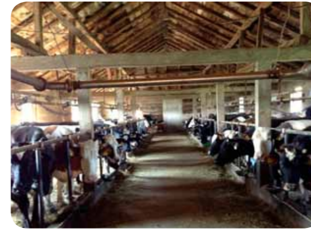
Dairy farm at Staro Nagoricane