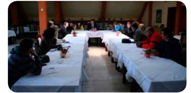
Meeting Dimitrije Pamhović, Mayor of Nova Varos Municipality