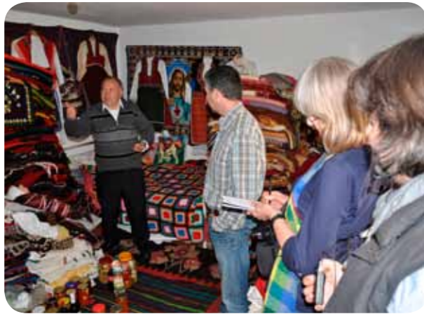
Museum of traditional costumes at Rezanovce