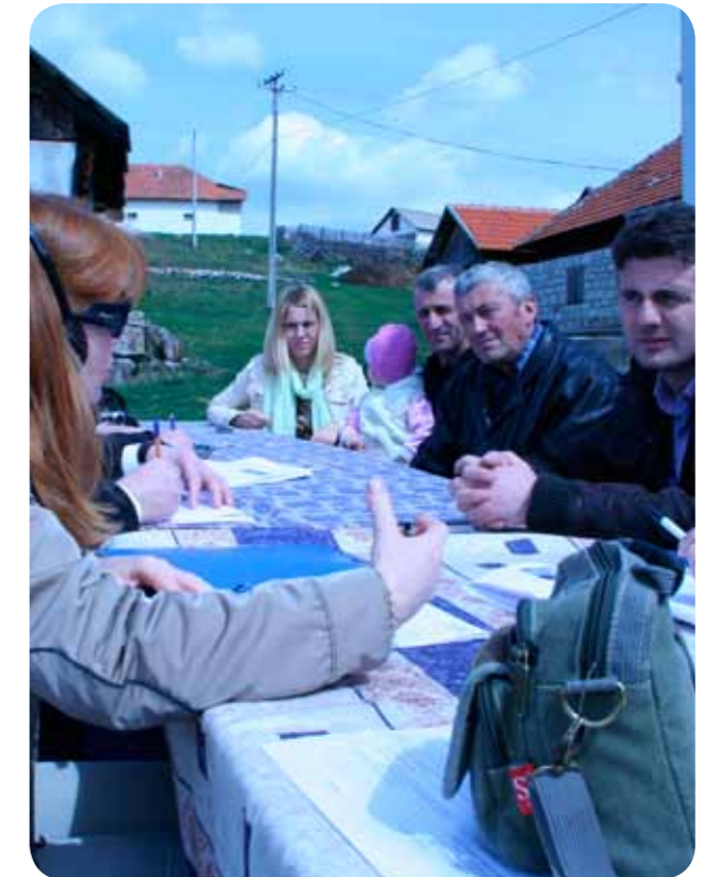
Meeting the Cattle Breeders Association, Nova Varos