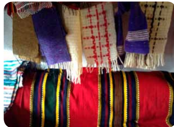
Products of the Serafim Association of Women Weavers, Berovo municipality

The need for a strategic context, through which individual heritage sites might benefit from tourism, was the impulse behind an initiative in Slovenia, which might usefully be studied by Staro Nagoricane Municipality and St. George's Church. This was the creation in the 1990s of the Dolenjska – Bela Krajina Heritage Trail, which embraced over 30 individual heritage sites – each too small to generate a flow of tourists – and created a successful regional tourism product.