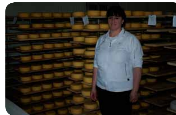
The cheese factory ‘Cevo Katunjanka’ in Danilovgrad