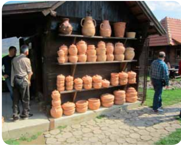
Visiting the pottery shop at Zlakusa