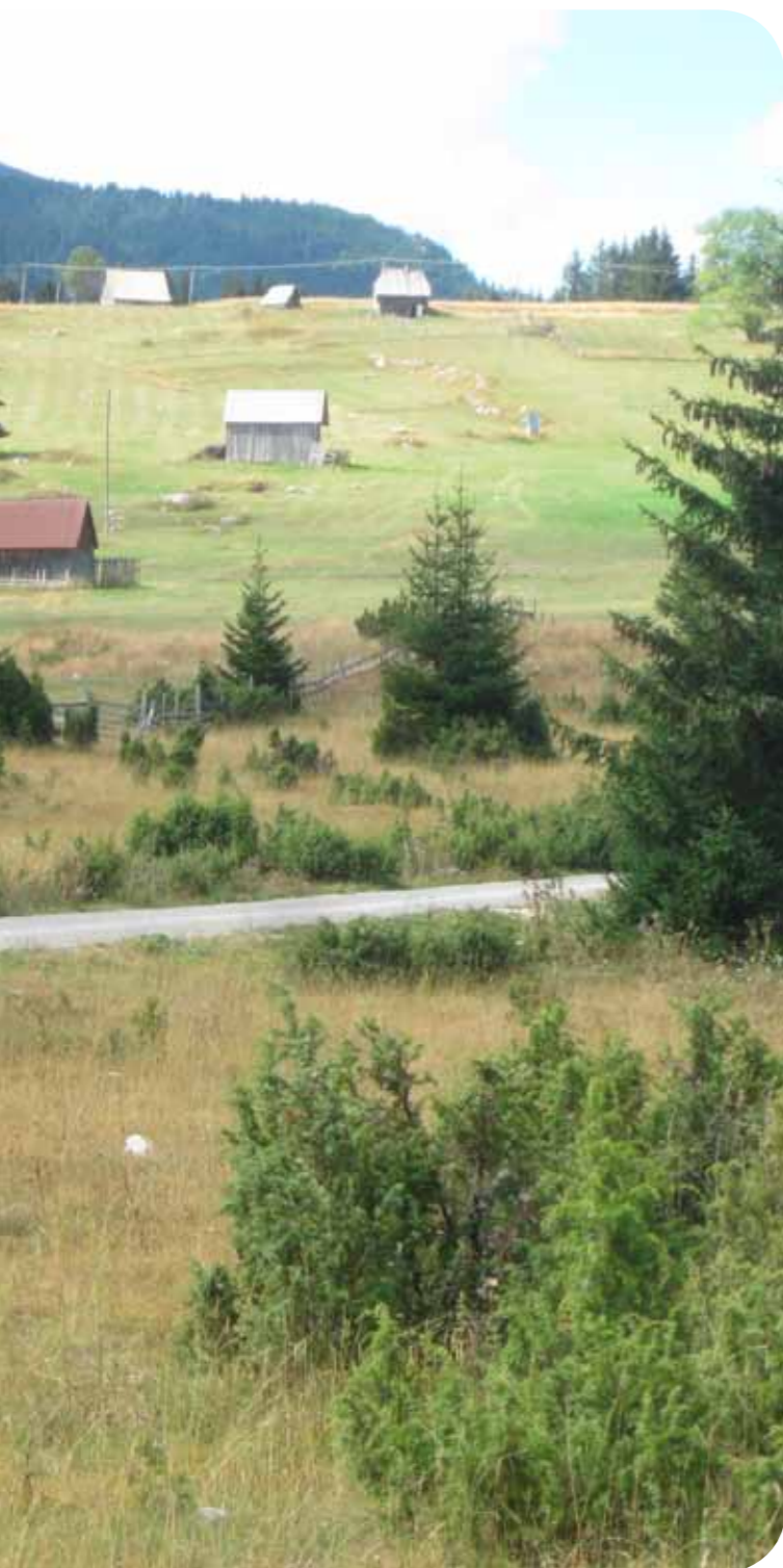
Hill farming landscape near Žabljak, Montenegro

near the capital; and Cetinje, Kolašin and Tomaševo (municipality of Bijelo Polje), more distant from Podgorica. This difference appears to be significant in terms of the ease or difficulty of selling farm products to the urban population. In total, the groups met 14 enterprises, all connected with production of different types of food, including beef, milk, cheese, apples, cornel-berries, mushrooms, herbs, wine, vegetables and honey.