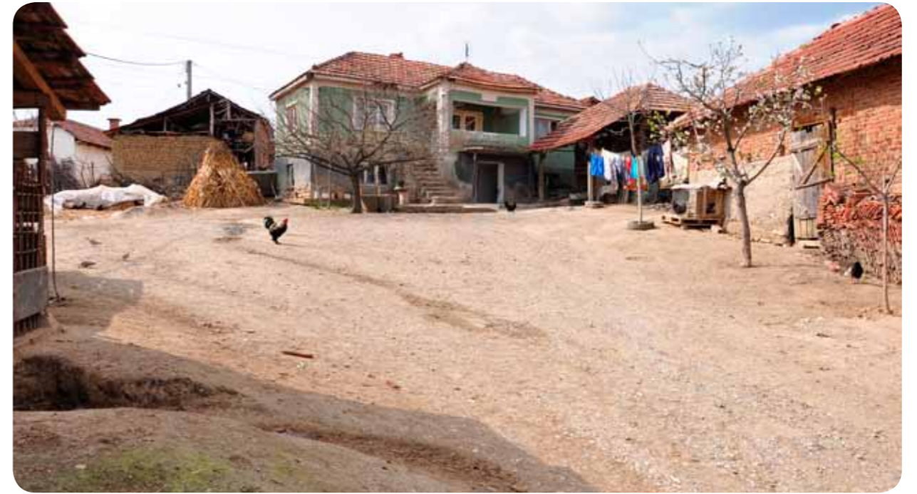
Rezanovce village, the former Yugoslav Republic of Macedonia

Co-operation and networking. The strengthening of rural economies could be much assisted by a greater degree of cooperation and networking between enterprises than now exists. Such cooperation could strengthen the bargaining power of farmers and other enterprises; assist the process of adding value to rural products; provide the resources for effective marketing campaigns; and raise the voice of rural enterprises in dealings with government. Some leading entrepreneurs have well understood these benefits, and are actively promoting cooperation. But among the wider sector of farmers and enterprises there appears to be a strong