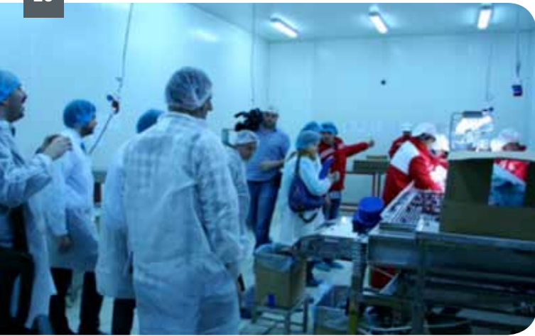
Visiting the freeze-drying room for raspberries at Drenovac Fruit Processing Company, Arilje