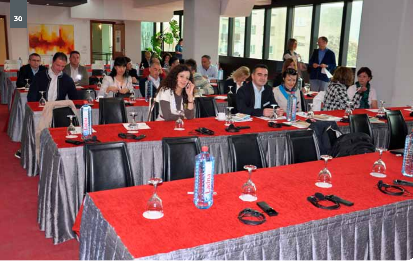
National Conference in Skopje

vicious circle of weak rural economies, unemployment, outmigration, inadequate rural services, and poor infrastructure. The links between all these elements of weakness mean that the solution cannot be found in only one sector of action. If they are to stay in rural areas, young educated people need both jobs and rural services. Rural enterprises depend upon good basic services and infrastructure. For these reasons, the policies and actions for rural development must be integrated, and they must be suited to addressing the specific needs of each region or municipality. This implies the need for clear linkage and complementarity between the policies of central government and the local development strategies at municipal level.