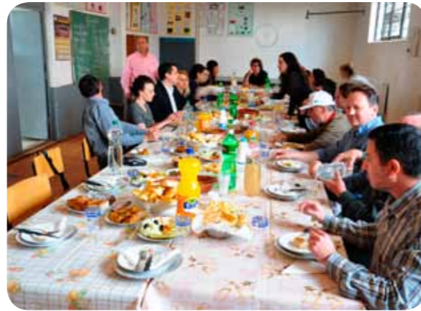
Meeting villagers at Rezanovce School