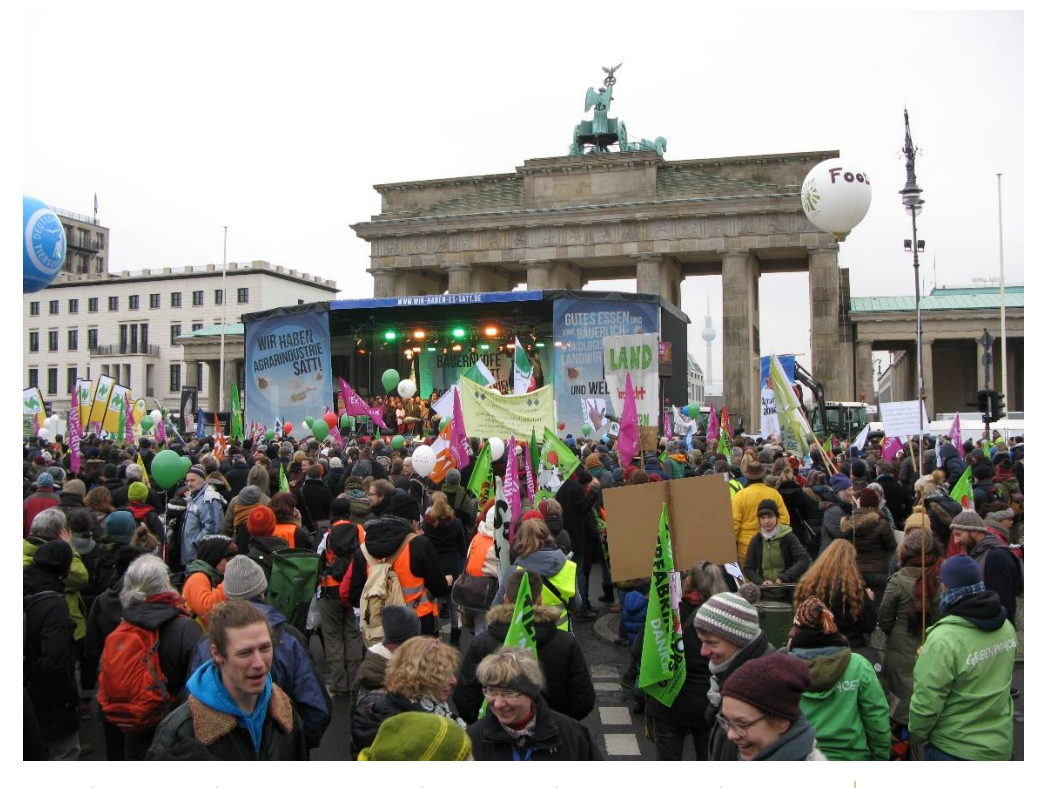
Wir Haben es Satt demonstration in Berlin, 2015.

In this context, grassroots groups and social movements such as landless workers, fishers, peasants, herders, nomadic and indigenous peoples stand in a unique position because they can give direct evidence of the shortcomings and problems that interfere with or prevent the realisation of their right to land. Yet often these groups or movements do not have enough information about the reasons and persons responsible for these shortcomings and problems; they may lack methods and tools to collect, organise and analyse information in order to be able to use this knowledge to generate a change in public policy.