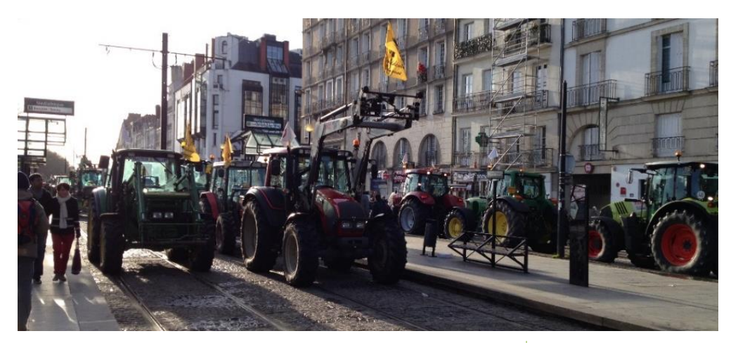
NDDL Gathering in Nantes, 2014.

Land is a tangible thing – something right in front of us, which we can see and feel, and a place where we can be and experience – and act. The struggle for land has long been fought on the land itself, in occupations and in resisting evictions. The history of land struggles both in Europe and internationally is almost inseparable from a long tradition of direct action, with the organization of social movements and broader social struggles playing a huge role.