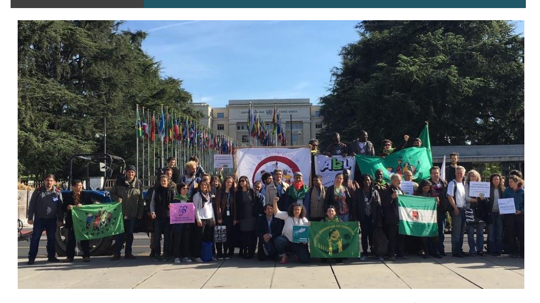
Delegation from the negotiation of UNDROP in Geneva.

Engaging in international decision-making spaces has been one of the strategies of social movements and civil society organisations (CSOs) aimed at advancing their rights. Such work is based on the conviction that peoples' struggles for land and territory cannot only be limited by the national borders of our countries, but need to be internationalist struggles.