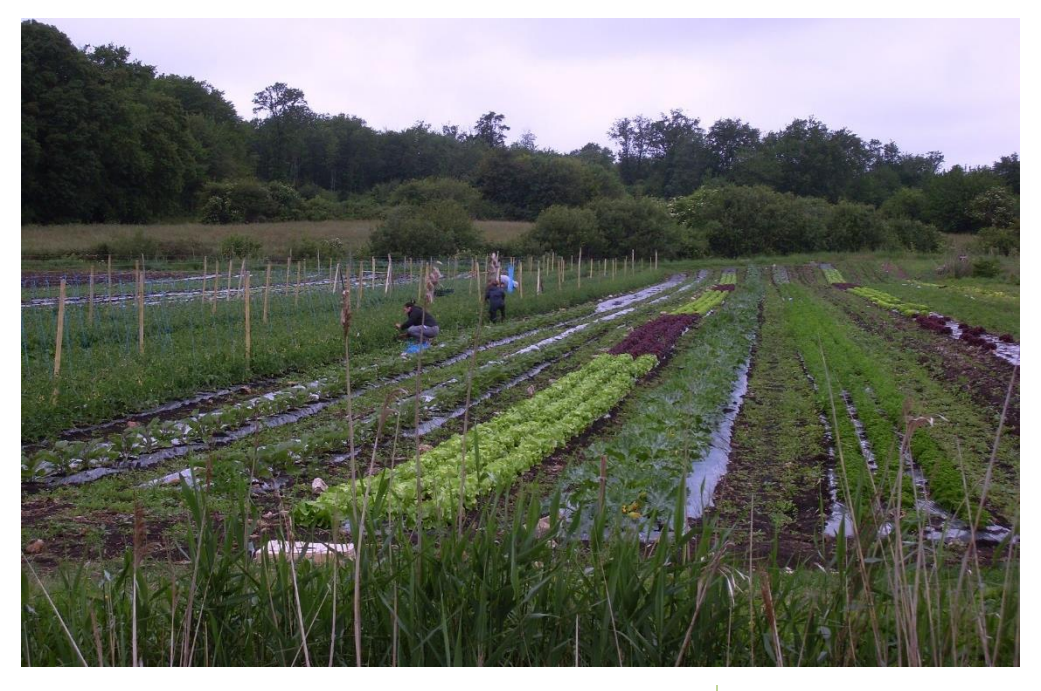
Working the land.

Today tenant farming is the most widespread form of land occupancy in certain North -Western European countries (Belgium, Germany, France, etc.) as well as in certain Central and Eastern European countries (Bulgaria, Czech Republic, Slovakia), and it is rapidly growing. This form of land occupancy contains complex realities: in some cases, farmers rent to their own family, or to a land property company which they own (fully or partially). In other cases, farmers own their own land and rent additional land; others rent all of their land from one or several owners.