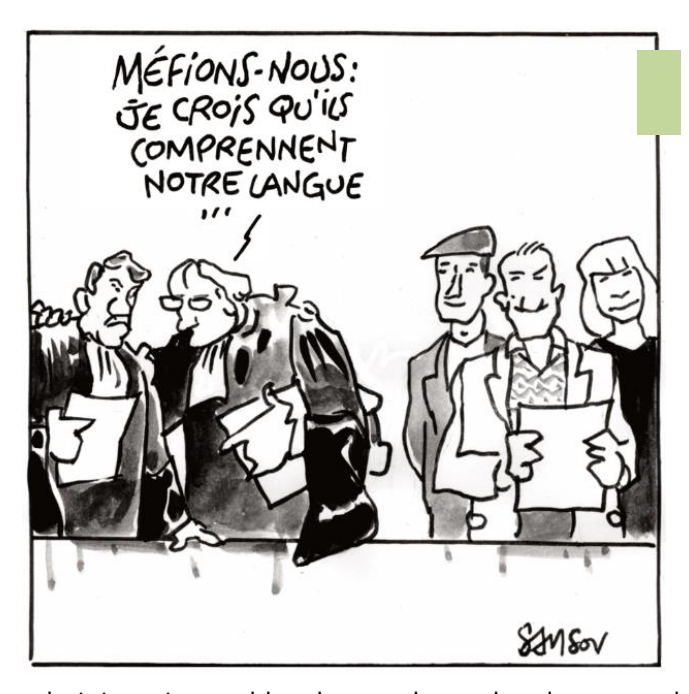
'Watch out, I think they speak our language.' Credit: Samson

The initial contact happens over the phone in order to judge the level of urgency and assess if a face-to-face meeting is needed during one of the monthly sessions which take place in each of the departments of the Rhône-Alpes region. Some of the requests are dealt with directly by phone, without additional meetings.