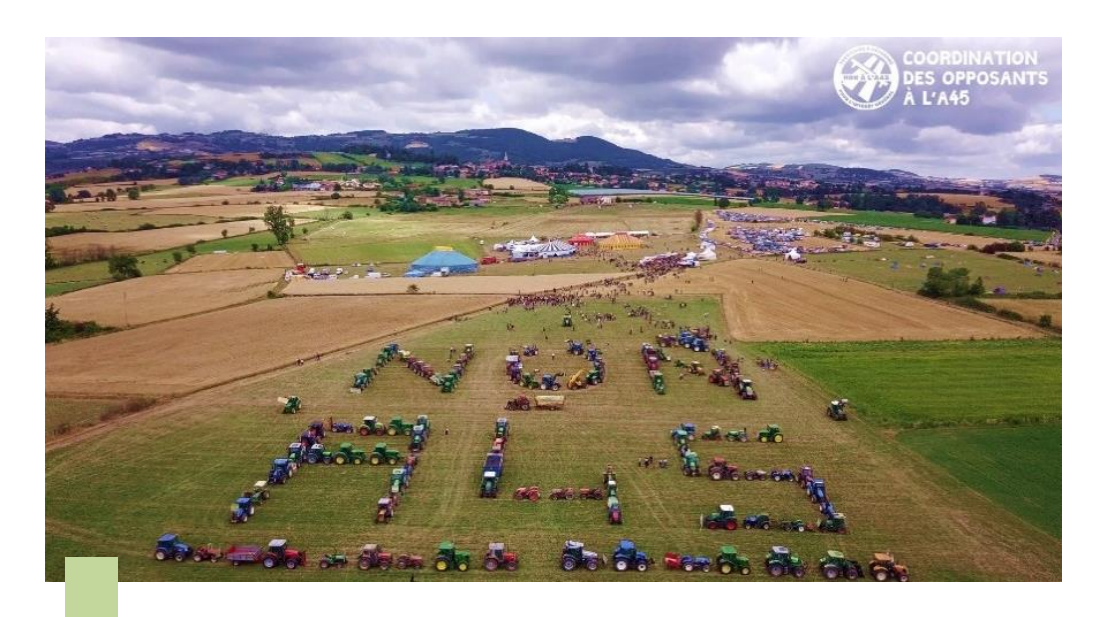
'No to the A45' demonstration in Saint-Maurice sur Dargoire

The first meeting with other organisations took place in July 2016, a time