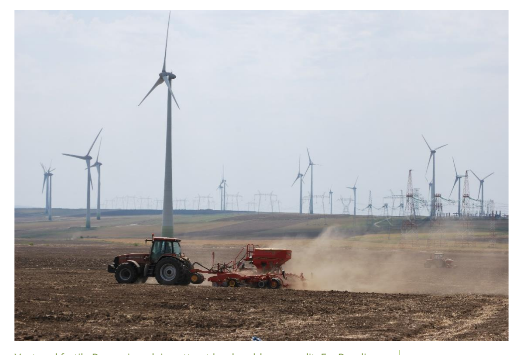
Vast and fertile Romanian plains attract land grabbers

very dubious legality, used the EU farm subsidies they received as rent guarantees. And it ended looking at the policy drivers that made the whole scheme possible, both through the Common Agricultural Policy (CAP) that drives the price of land upward across the EU, and the trade policies that have undermined the markets which maintain local peasant economies.