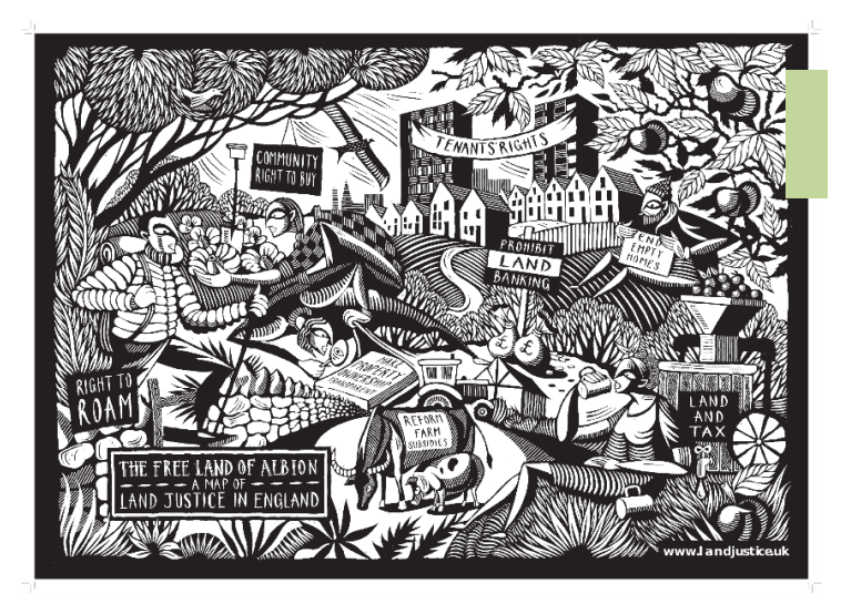
Illustration from Land Justice Network's pamphlet on land issues.

Early in 2015, an event on land took place at the UK's Houses of Parliament. It was hugely popular with far more in attendance than the room's capacity, but sadly both the speakers and general quality of the discussion were unsatisfying. The room was dominated by a small number of people who wanted to have very technical disagreements about land taxation. This prevented everyone else from exploring areas of interest which might have been more inspiring and useful.