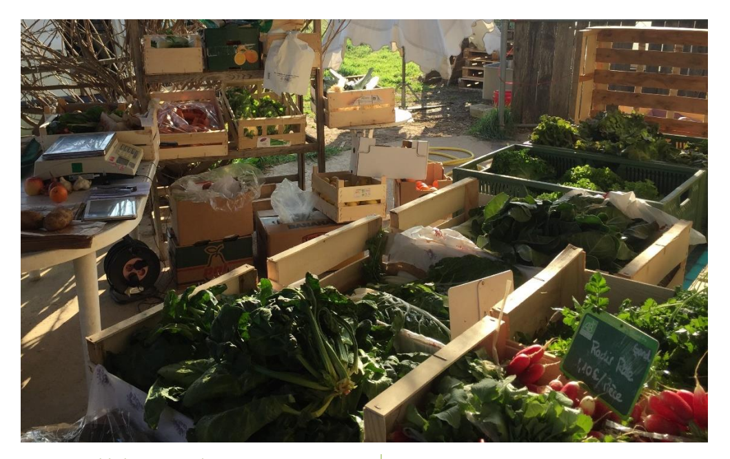
CSA Vegetable boxes

GeLa Ochsenherz<sup>98</sup> is the oldest Community Supported Agriculture farm (CSA) in Austria: it has been running since 2010 and was established to save a Demeter farm that produces vegetables, fruit and open-pollinating seeds. The CSA farm is located in Gänserndorf close to Vienna and has about 300 members.