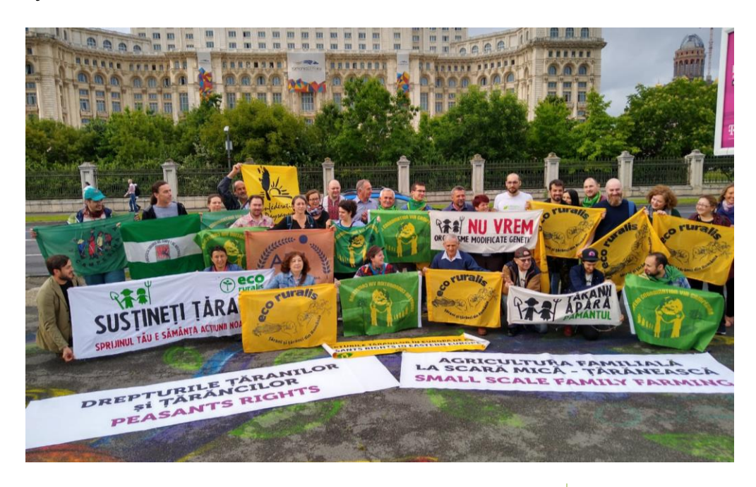
Mobilisation in front of the Romanian Parliament

organizations and civil society organizations actively participated in the development of the Tenure Guidelines and succeeded in integrating a number of key demands into the document.