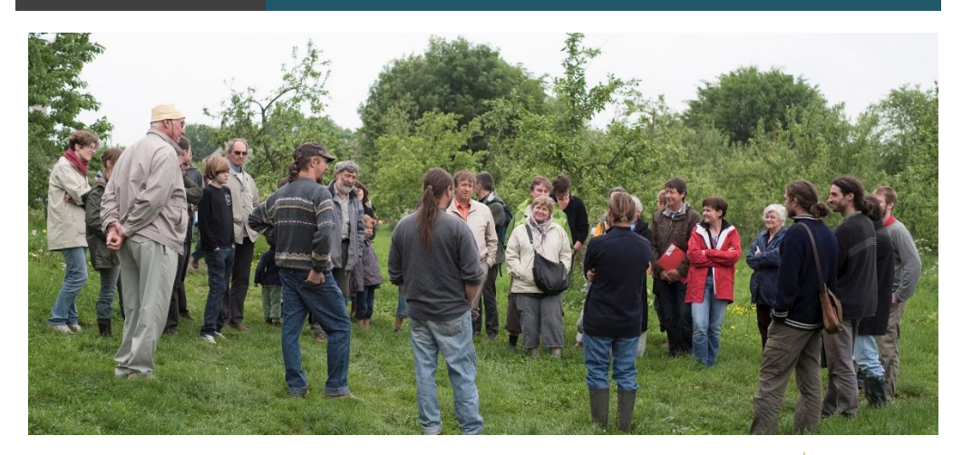
Farm Visit, Ohain Farm

In recent decades, growing social demands have emerged with regards to food and farming. They are the result of numerous crises massively affecting food safety and public health, academic and media reports highlighting the impact of industrial agriculture on natural resources, biodiversity or climate change, or the public debate around the adequate use of public money to support agriculture. At individual and collective levels, an increasing number of people have engaged in practices and mobilisations in favour of more sustainable practices, local quality food and nature conservation. This has taken many forms such as the rise of organic food consumption, the focus on seasonal food and food miles, the development of local food provision for school restaurants, or the development of local food systems.