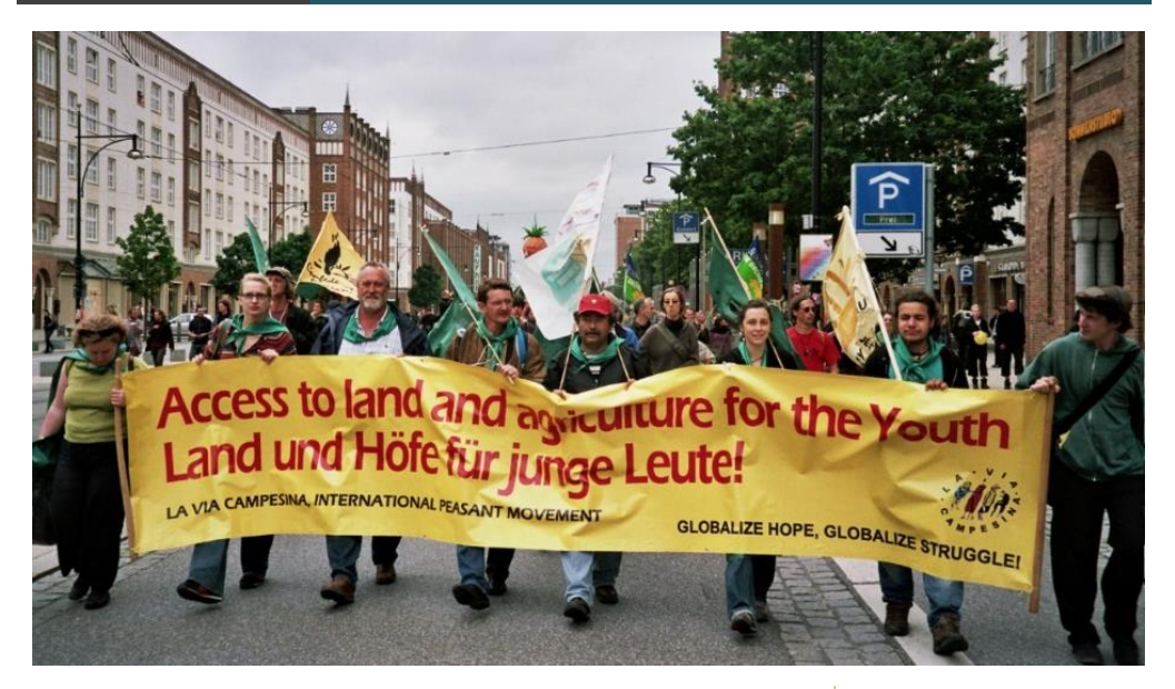
Public land can be used to ensure land access.

Nation States are amongst the largest landowners on the planet. While percentages vary from country to country, largely due to different political and social histories, public bodies are often among the largest individual landowners. Therefore, the management of public lands is a vital element in creating a sustainable land use strategy and in ensuring that land is used in the best interests of society as a whole. In many European countries, local authorities are the owners and managers of farmland and forestry, particularly green belts.