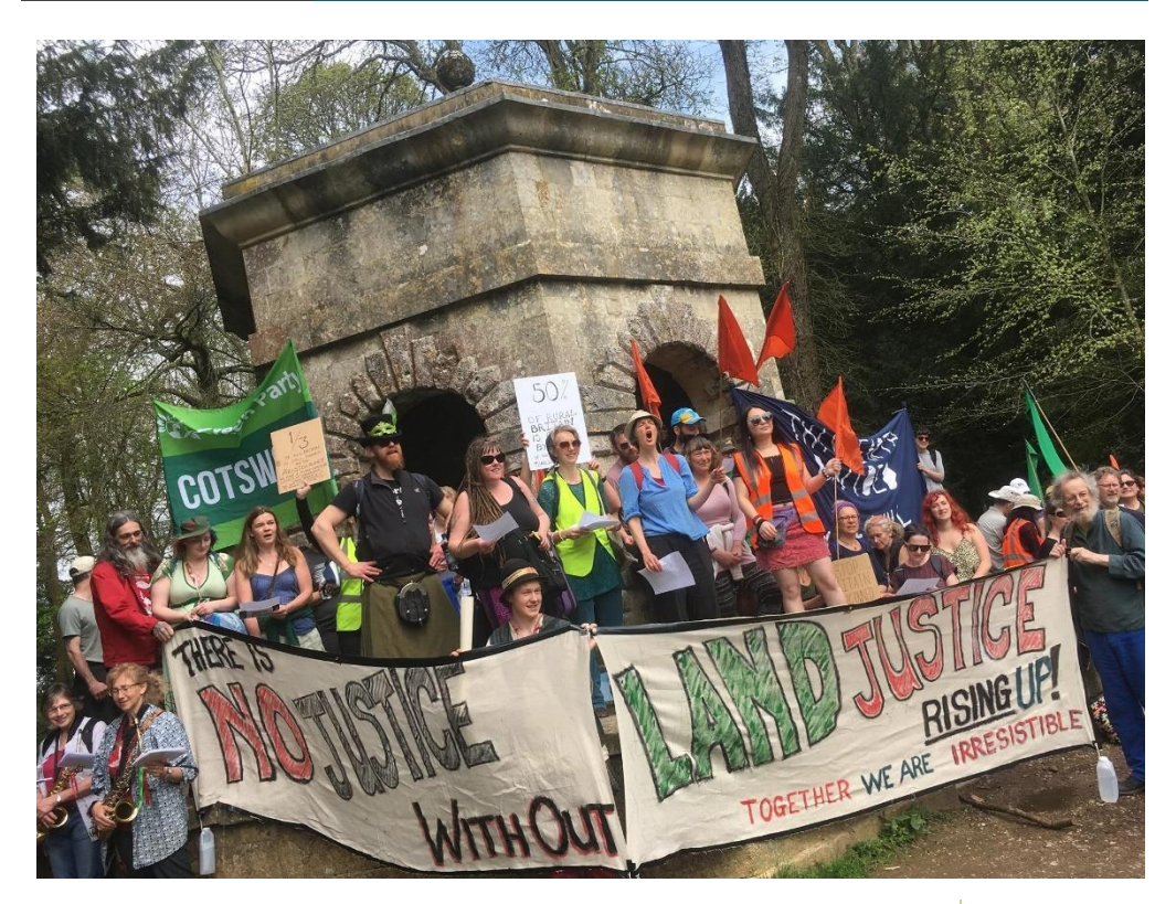
Land Justice Network's mass trespass of Lord Bathurst's Estate in Cirencester.

Land - particularly farmland - is often little debated in the public realm. There are widely different histories and narratives about land throughout Europe. However, land is a cornerstone of private property in all regions. Generally considered as capital or an asset, land is often seen as an economic rather than a political issue - to be regulated through contract law and land markets.