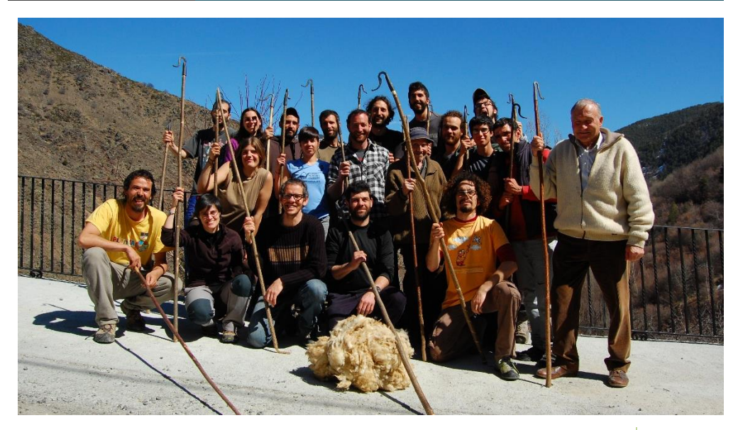
Grazing sheep play their role in agroecology

European farmers are a greying population. More than half of European farmers will retire within 10 years, while only 7% are under the age of 35.87 Many senior farmers have no successors in their family, and have no identified successor outside it either. In the next two decades, millions of hectares will change hands. What happens to that land when it reaches the market is crucial to the future of our food system, and current trends point in the wrong direction. Without active mobilisation, this land will fuel land concentration and industrial farming, at the expense of peasant agriculture, agroecology, new farmers, organic farming and local food systems.