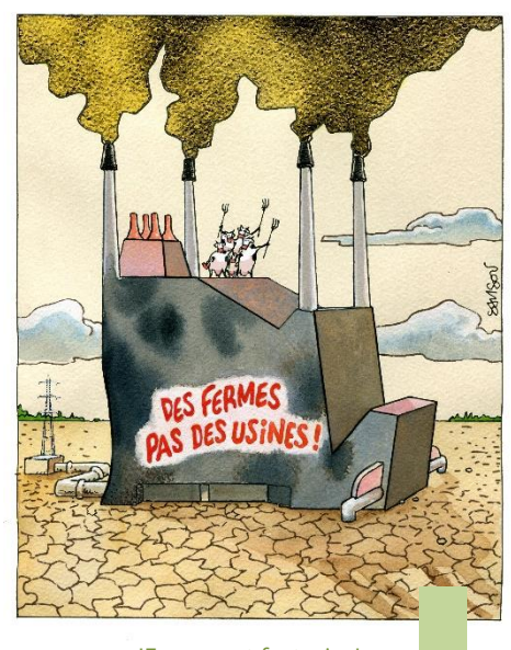
'Farms not factories', Credit: Samson

Mega-infrastructure projects such as intranational train systems, motorways, mining, energy production and airports have huge budgets (often supported through EU Cohesion funds) and offer very little if any consultation with local communities. Moresoever, they explicitly may offer little or no benefit to the populations where they are located and in return have colossal impacts on local ecologies, land and social systems to the detriment of those populations. In some countries public works projects and government policies are closely tied up with large manufacturers and lucrative cement government contracts offered. A diversity of strategies have long existed in civil