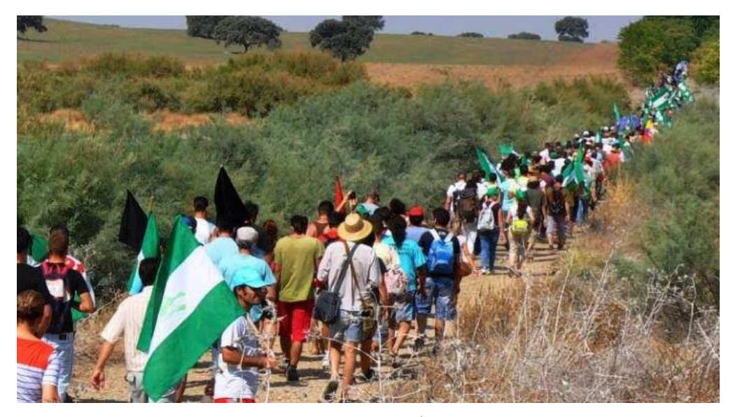
Ocupation of Somonte, Andalucia.

The various strategies for mobilizing around land outlined above often very quickly run into practical barriers – be those political, institutional or economic. Overcoming these barriers, and enabling land movements to have the longevity, capacity and resilience to properly articulate and engage in their chosen strategy is paramount. In this section we investigate some of the broad strategies movements can use to strengthen their position, and some very practical examples of developing and building solidarity in order to provide resources and tools required to meet these goals.