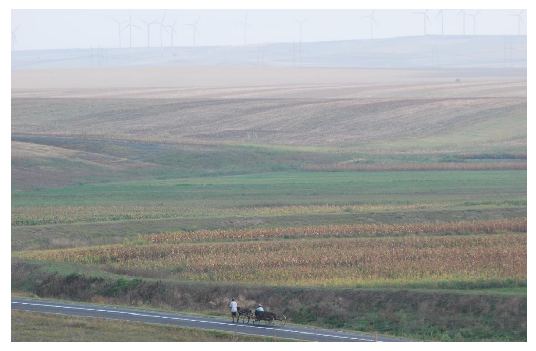
Peasant farmers in Romania

Any struggle for justice must start from the basic question: what is going on? Without having a firm grasp on this most basic of questions, the difficult task of reconciling competing claims is made even more challenging.