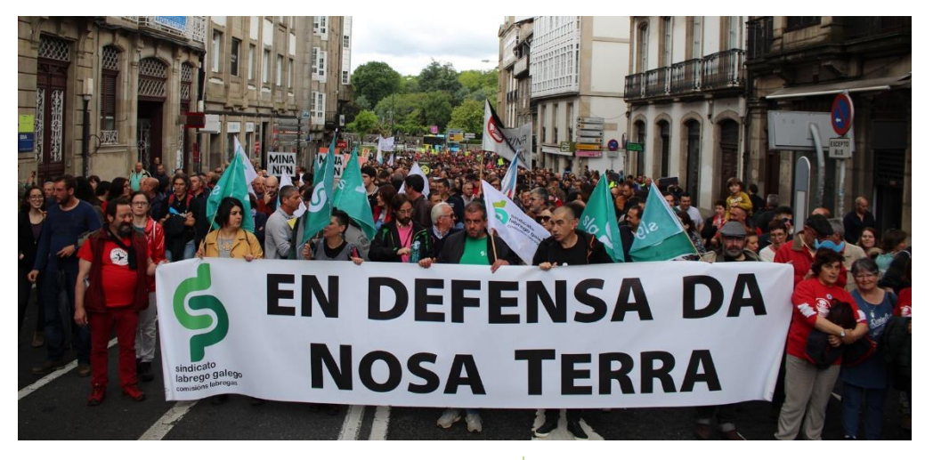
'Defending our land', ECVC member organisations

Campaigning against land loss: Fighting infrastructure, urbanization and agribusiness projects