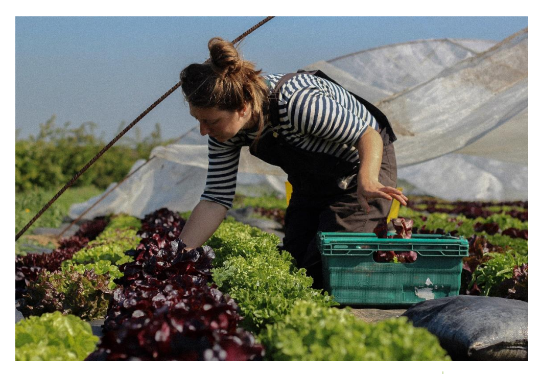
Salad harvest at Sutton Community Farm

The initial goal was to use a specific farm business tenancy, that exists only in England. However, this appeared to be more complex than initially imagined. Fortunately, the negotiating group managed to get its own legal advice, pro bono, via the Community Land Advisory Service<sup>80</sup>, set up specifically to help initiatives like community gardens and community farms.