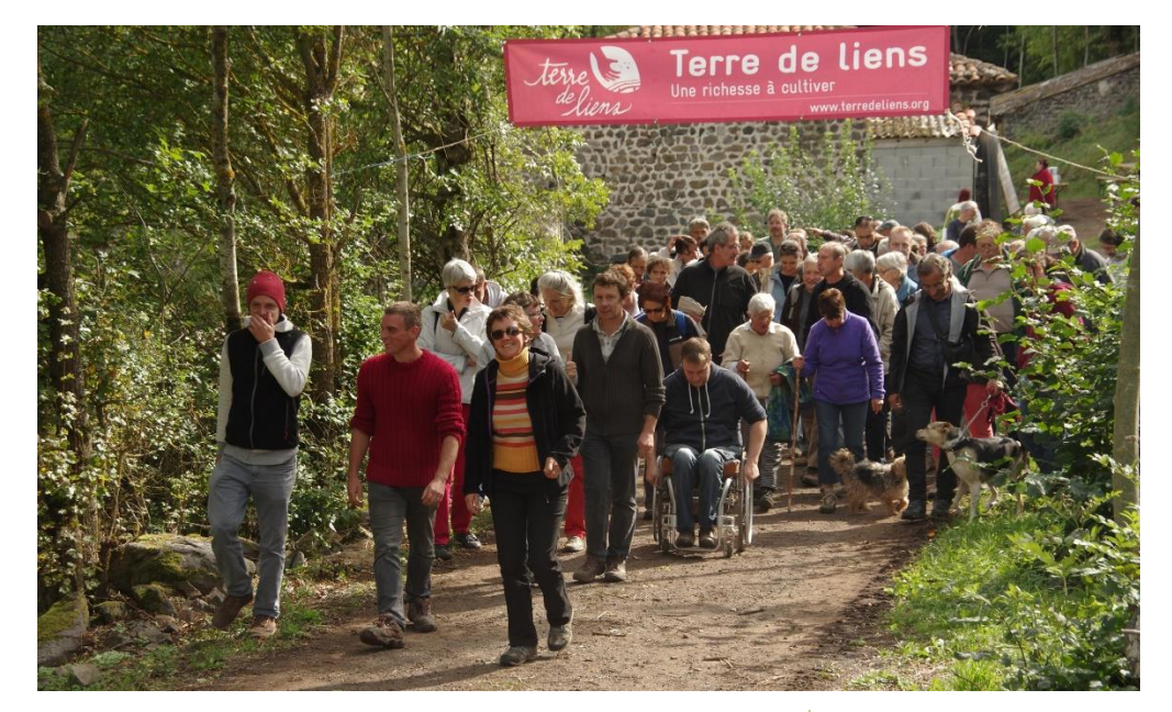
Farm walk on Eygageyres Farm

Terre de Liens acquired 27,5 hectares of land, corresponding to the former Eygageyres farm. The hectare was for sale at €3,253/ hectare (incl. SAFER costs) which was a good price for the seller given the state of the farm. The amount was collected in about 6 months, thanks to 104 citizens, associations and businesses who invested to support the project.