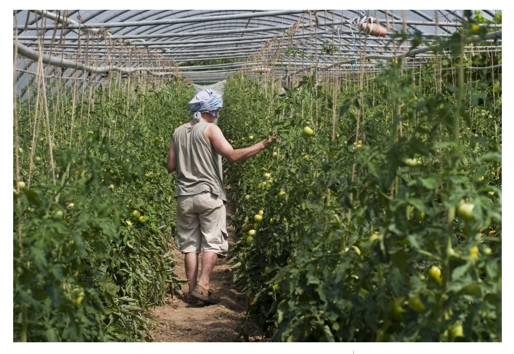
Growing tomatoes

The first meeting on a campaign or local issue can sometimes feel like searching for the light switch in a darkened room. There may be little or no concrete information available about the issue at hand. The skills and capacities of the group are often unknown, personal relationships have not been built, and there may be great energy and enthusiasm, but little clear ideas about where or how to channel or direct it. There may also be feelings of desperation - that the local government or private companies are holding all the cards.