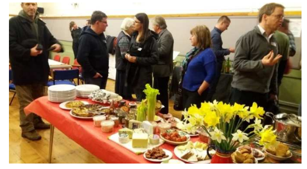
International Buffet - regional food a communicating factor